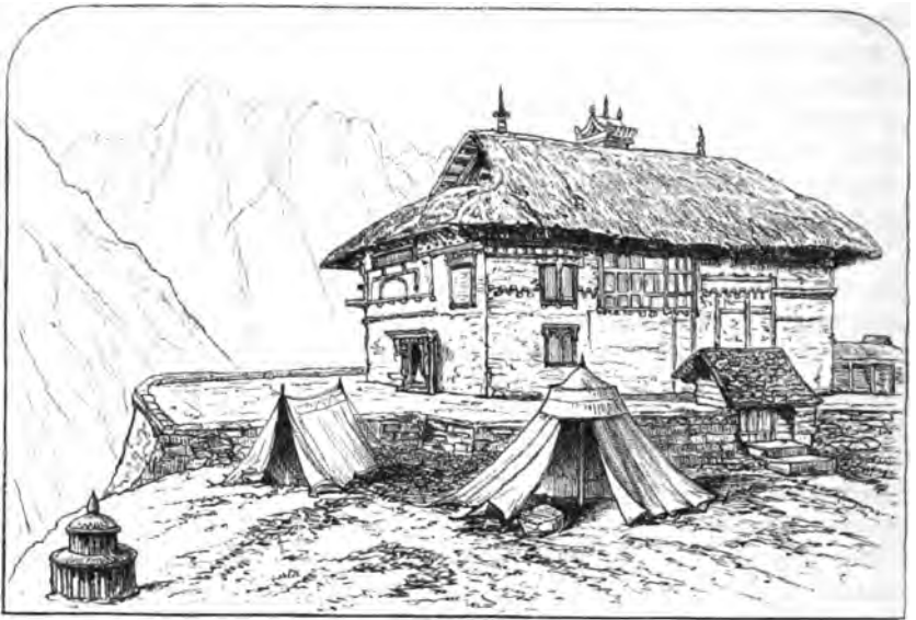
I.—PALACE OF THE RAJA OF SIKKIM AT TUMLONG.

to conduct you by what I may call the route of the artist. This route commences with an upper crossing of the Tista on the road leading northward from Darjiling. This is a very different crossing from the previous one I have described, and much more difficult; I very nearly had my riding ponies drowned at this spot. However, I and my staff got safely over, and commenced the ascent of the low hills over which the road lies, until we reach a point opposite Tumlong, whence we descend to a river, then re-ascend to Tumlong, and afterwards descending again to the river and ascending towards the Chomnaga Valley and the Chola Pass. It was in the Chomnaga Valley that Dr. Campbell and Sir Joseph Hooker were seized and pinioned, and placed in durance vile. I have already explained to you that the finest rhododendrons grow on the western part of Sikkim towards Nepal; but second to