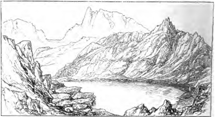
VII.—TARN NO. 3 AT FOOT OF YAKLA PASS.

We now come to tarn No. 3, which is exactly at the foot of the Yakla Pass. The Yakla Pass is just visible in the illustration, marked