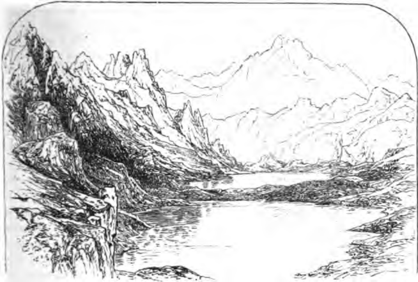
IV.—BHEWSA LAKE. MOUNT KANCHANJANGA IN THE DISTANCE.

On the southern spur of the Chola range lies the subject of our next picture, the Bhewsa Lake, which is much lower than those which I have