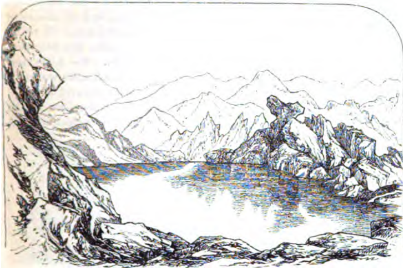
V.—TARN NO. 1 ON ASCENT TO YAKLA PASS. DARJILING HILLS IN THE DISTANCE.

three very little lakes, for which I will adopt our President's designation of tarns. The first of these is overhung by some very weird, strange-