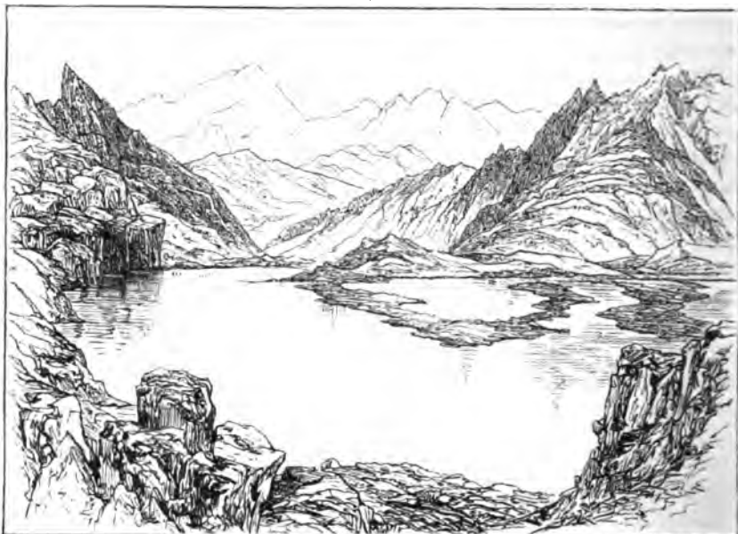
III.—CHOKHAM LAKE ABOVE CHOLA PASS. MOUNT CHANGU KANG IN THE DISTANCE.

and particular manner possible. Wherever I went, my footsteps were dogged by Chinese and Tibetan officials. Even if I stopped to take a sketch, these gentlemen were always considering whether my foot was