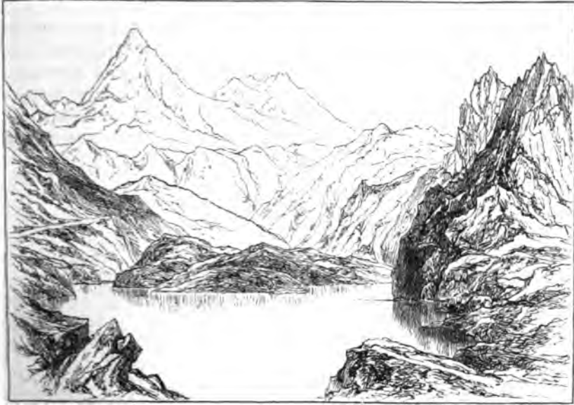
VIII.—YAKLA PASS AND LAKE. MOUNT CHUMALARI IN THE DISTANCE.

on the left of the obelisk—the whole of the features together make up a truly lovely view, most difficult to sketch, I admit, because of the extreme, biting cold and the wind in that exposed position. The colour