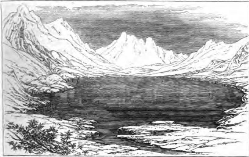
X.—BIDANTSO LAKE AFTER A SNOWSTORM. MOUNT GIPMOCHI IN THE DISTANCE.

I have now to ask you to ascend to the top of the forest-clad hills in the middle distance of our picture, and then to turn off towards the right; you will then be in the immediate neighbourhood of the next